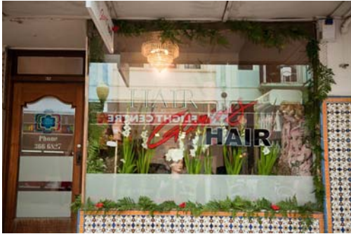
People's Choice & Bronze 3 rd Prize Hair Glorious Hair