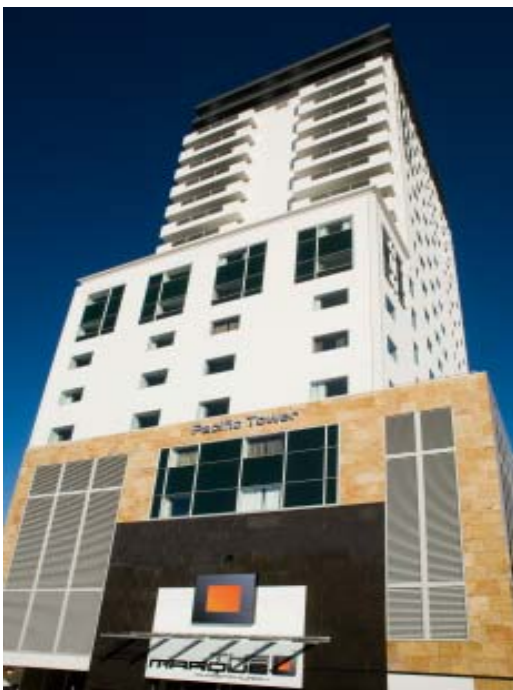
Photo Courtesy of New Regent Studios 16 th April 2010 © New Regent Studios Ltd

The Marque celebrated their soft opening on the 18th March and many businesses from the street attended. The highlight of the night was a Maori Performance and Blessing of the Hotel followed by guided tours up to the upper floors. The new hotel is now open along with their Restaurant 'Fresh'. The hotel with a total of 171 Rooms boasts clean, contemporary design and technology that's always on!