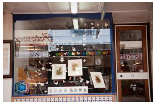
Silver 2 nd Prize Antique Print & Board of Design