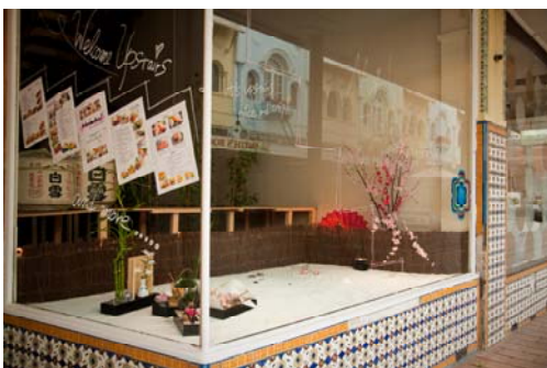
GOLD 1 st Prize Maido

The prize winners in the street were as follows: