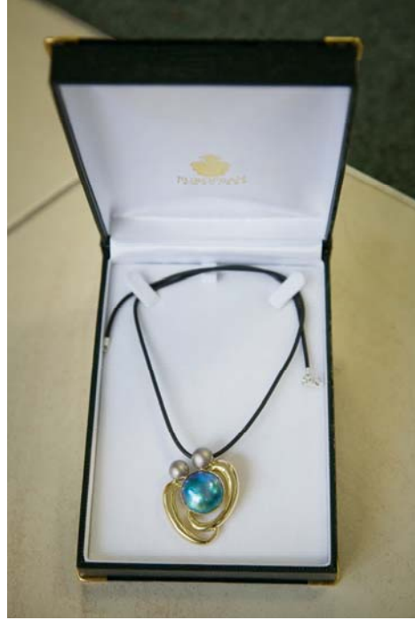
As pictured. The Unique Blue Pearl Pendant (Supplied by New Regent Studios Ltd)